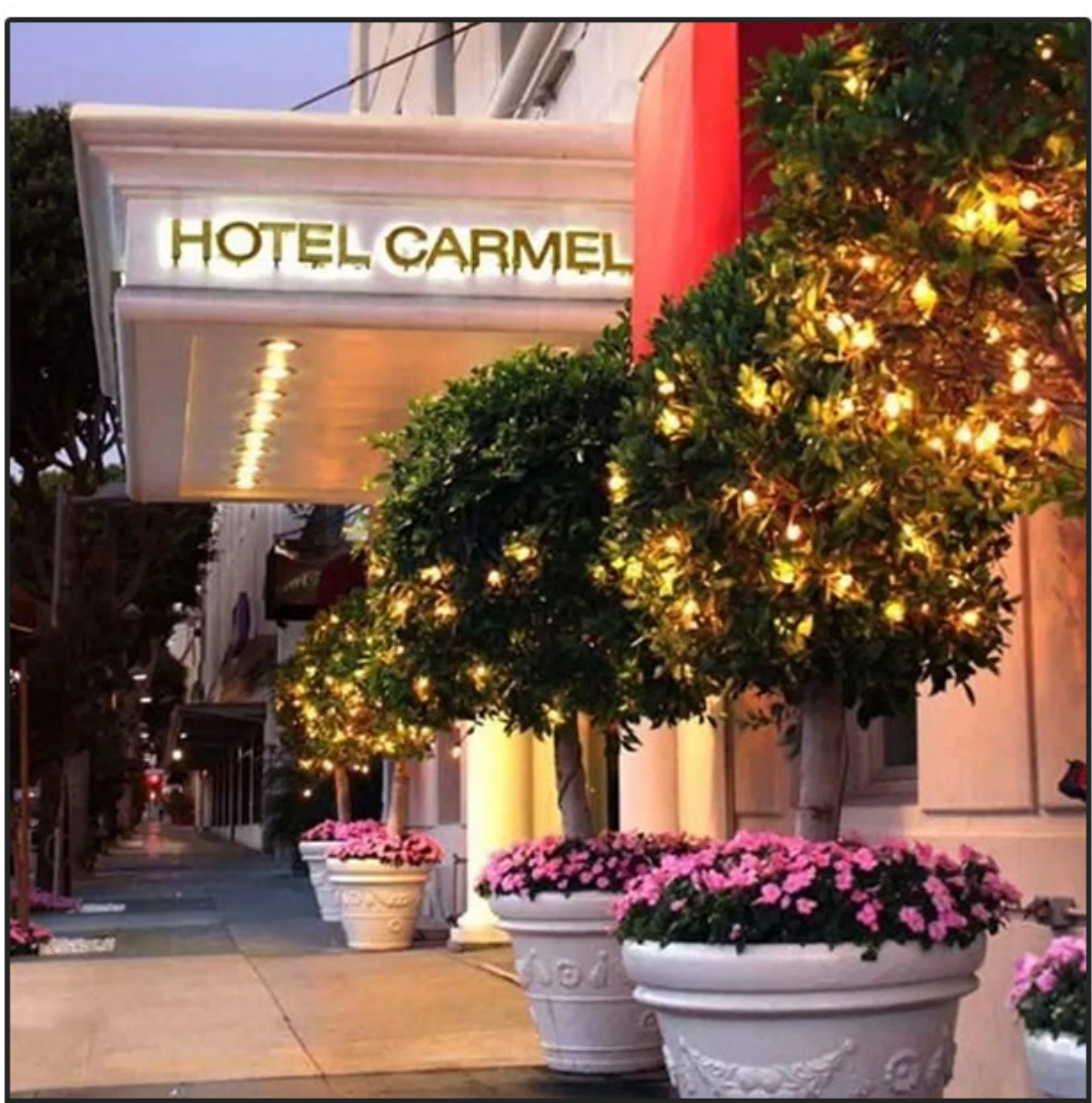
The Hotel Carmel CARMEL-BY-THE-SEA, CA