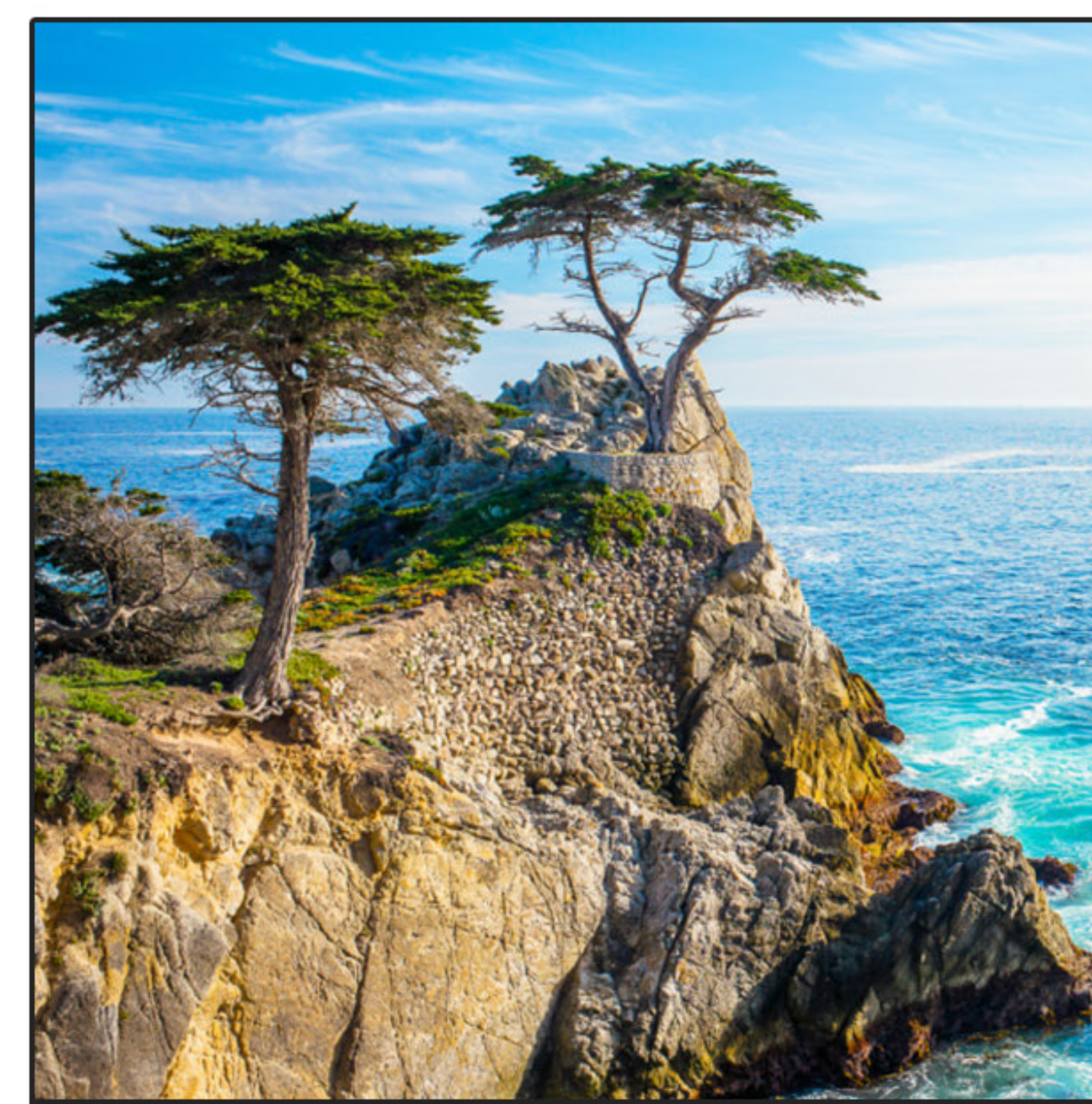
Pebble Beach in Monterey MONTEREY, CA

JOE RAMOS 805.680.6849 JoeRamos@bhscal.com DRE 02040488