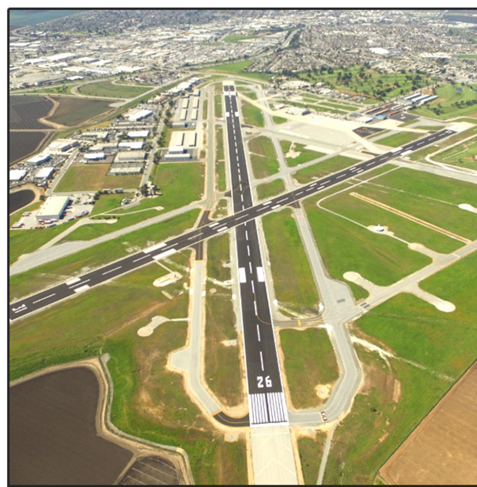
Salinas Municipal Airport SALINAS, CA