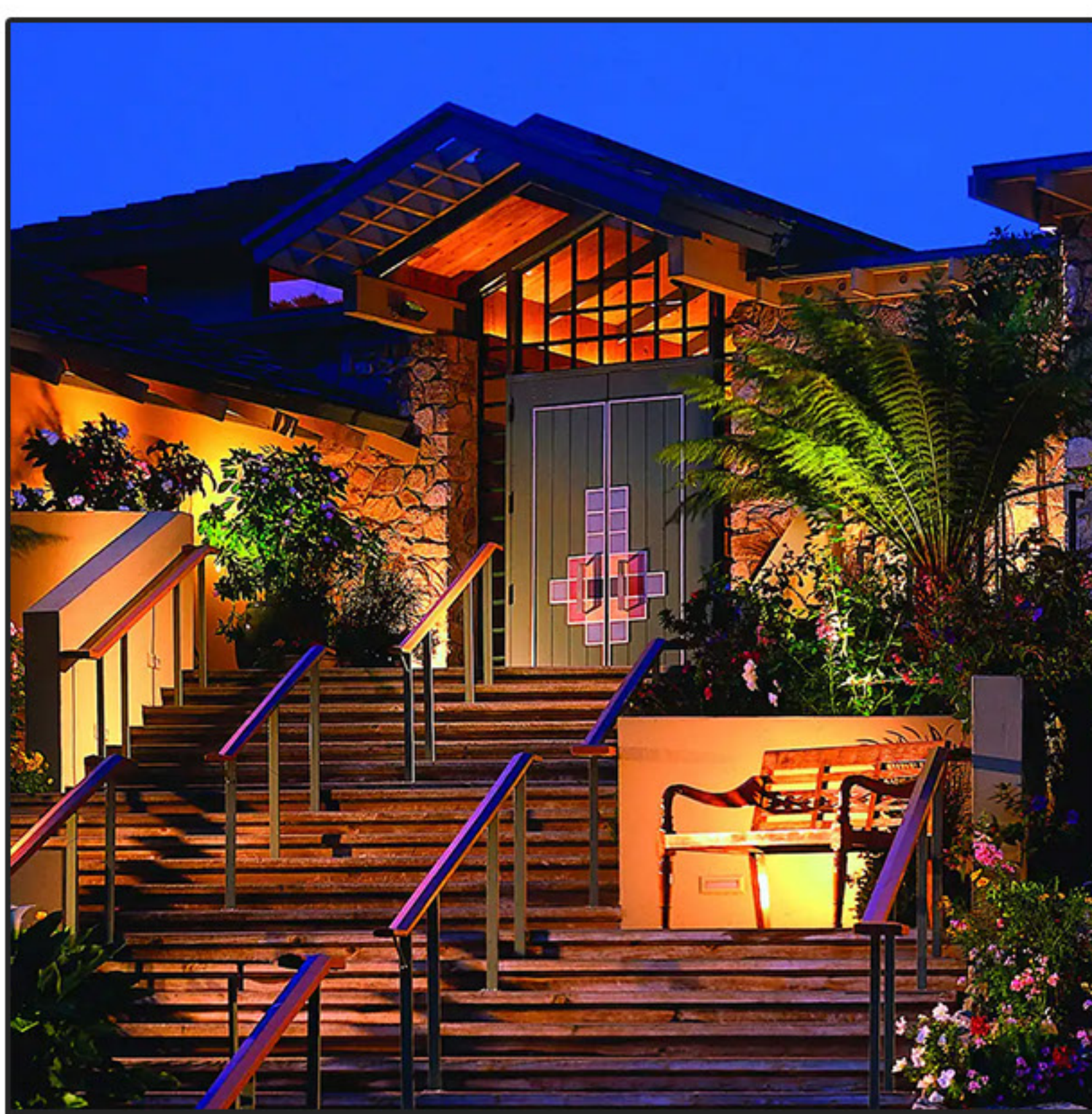
Hyatt Vacation Club CARMEL-BY-THE-SEA, CA